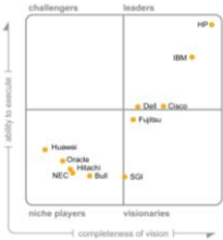
Gartner Magic Quadrant for Blade Servers (Mar. '12)*